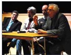
An expert panel