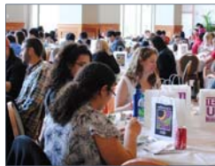
A Free Lunch